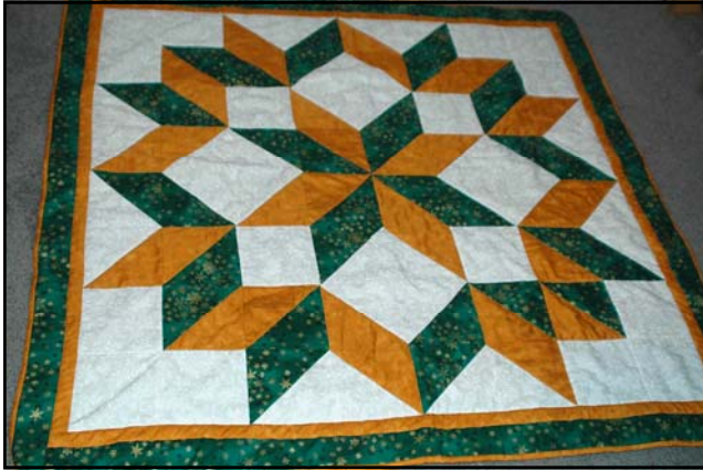
Star Pattern Quilted Wall Hanging by Miriam Hursey

The Peace River Wildlife Center Gift Shop has nature related gifts for everyone on your “giving list.” Our special items include shirts with embroidered birds and animals in various colors and styles, and hats with eagle or pelican embroidery. As always, our nature books for adults and children are great gifts. We have plush animals including the Audubon birds with authentic birdcalls. There is a large selection of Wild Bryde earrings and pendants along with the Zodiac semi-precious stone necklaces and bracelets.